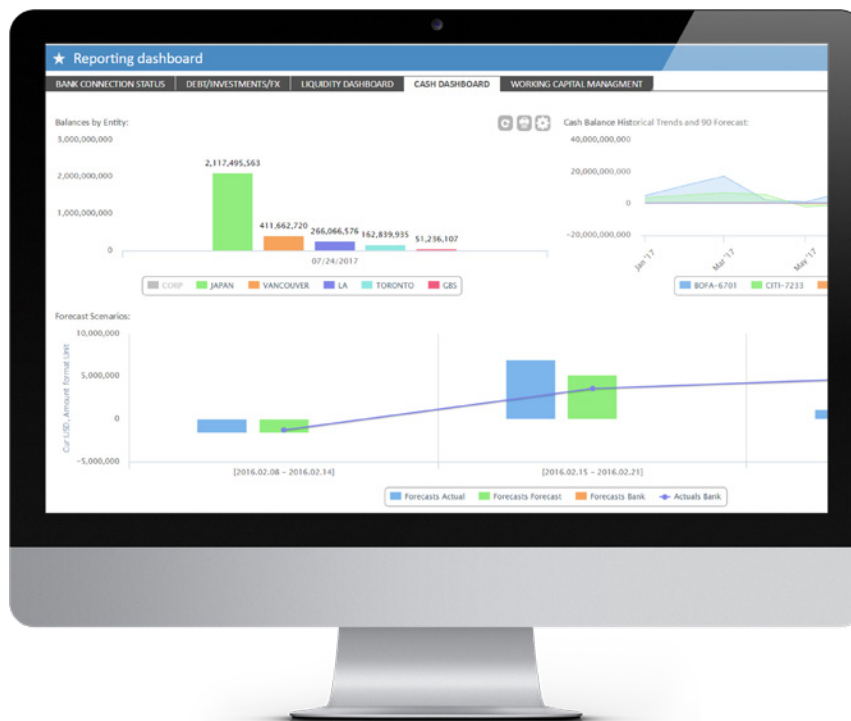
Kyriba's intuitive dashboards feature up-to-date snapshots of key trends related to cash and liquidity, working capital and more.

Full accounting support is offered, so that journal entries can be generated for interest calculations. In addition, entries can be created for in-house cash or non-cash movements. All transactions are approved and posted to the general ledger as part of the standard GL posting workflow.